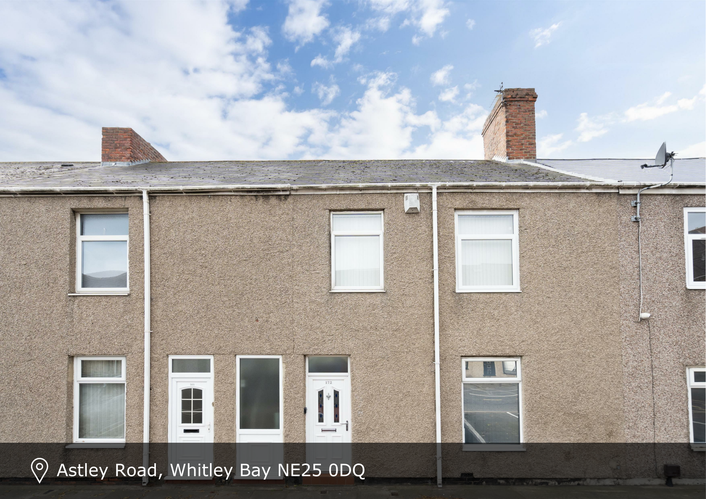
📍 Astley Road, Whitley Bay NE25 0DQ